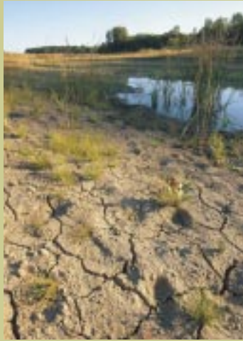
CRACKED EARTH signals the temporary demise of a frog habitat in the U.S. West.

Amphibian species inhabit a wide variety of ecosystems,