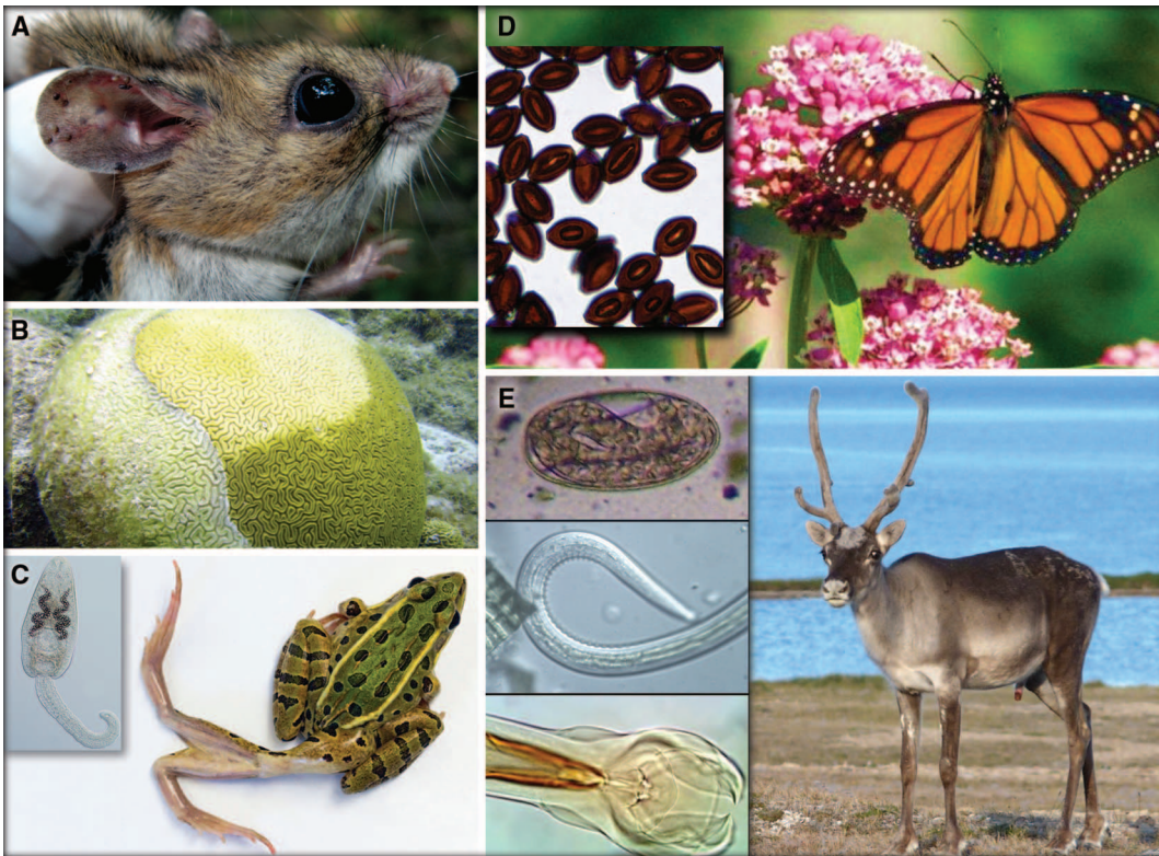
Fig. 1. Animal-parasite interactions for which field or experimental studies have linked climate change to altered disease risk. (A) Black-legged ticks, Ixodes scapularis , vectors of Lyme disease, attached to the ears of a white-footed mouse, Peromyscus leucopus , show greater synchrony in larval and nymphal feeding in response to milder climates, leading to more rapid Lyme transmission. (B) Caribbean coral ( Diploria labyrinthiformis ) was affected by loss of symbionts, white plague disease, and ciliate infection during the 2010 warm thermal anomaly in Curaçao. (C) Malformed leopard frog ( Lithobates pipiens ) as a result of infection by the cercarial stage (inset) of the multihost trematode R. ondatrae ; warming causes nonlinear changes in both host and parasite that lead to marked shifts in the timing of interactions. (D) Infection of monarchs ( D. plexippus ) by the protozoan O. elektrosirra (inset) increases in parts of the United States where monarchs breed year-round as a result of the establishment of exotic milkweed species and milder winter climates. (E) Infection risk with O. gruehneri (inset shows eggs and larvae) the common abomasal nematode of caribou and reindeer ( R. tarandus ), may be reduced during the hottest part of the Arctic summer as a result of warming, which leads to two annual transmission peaks rather than one (e.g., Fig. 3C).

warming involves infusing epidemiological models with relations derived from the metabolic theory of ecology (MTE). This approach circumvents the need for detailed species-specific development and survival parameters by using established relations between metabolism, ambient temperature, and body size to predict responses to climate warming (23). One breakthrough study (12) used MTE coupled with traditional host-parasite transmission models to examine how changes in seasonal and annual temperature affected the basic reproduction number ( R_0 ) of stronglyid nematodes with direct life cycles and transmission stages that are shed into the environment. By casting R_0 in terms of temperature-induced tradeoffs between parasite development and mortality, this approach facilitated both general predictions about how infection patterns change with warming and, when parameterized for Ostertagia gruehneri , a nematode of caribou and reindeer (Fig. 1), specific projections that corresponded with the observed temperature dependence of parasite stages. More-